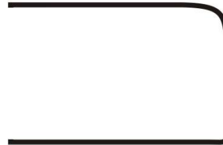
Big Eased $2.00 per linear foot