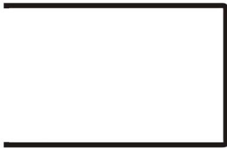
Eased Straight Included