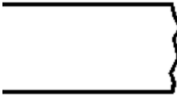
Chiseled or Rock Face Edge $15.00 per linear foot